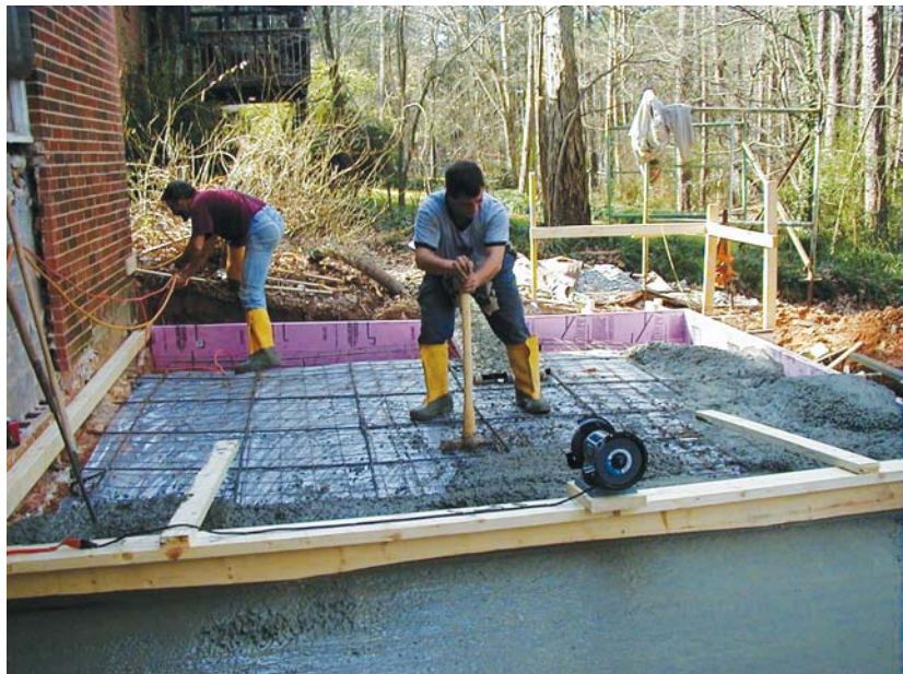
The foundation for the addition at the Creech-Pendergrast home renovation project includes edge insulation, which significantly improves the home's thermal envelope.

The first step in EarthCraft House Renovation is to assess the house to identify opportunities to improve the home's performance in areas that can be incorporated into the renovation pro-