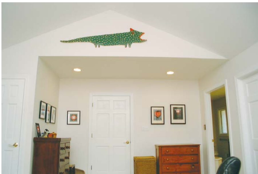
As part of the lighting improvements, the Creech-Pendergrast residence was fitted with new pin-type fluorescent bulbs.