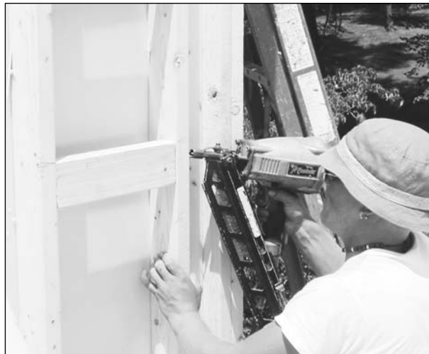
This efficient framing technique allows a continuous area for insulation to be placed behind the ladder framing.

is 38% less than MEC due to the use of a high-efficiency gas-fired water-heating system. The predicted annual energy input (not including the energy use of lights and appliances), normalized for floor area, including basement, is 18,296 Btu/ft 2 . The climate-normalized values are 3 Btu/degree-day/ft 2 for heating and 0.5 Btu/degree-day/ft 2 for cooling.