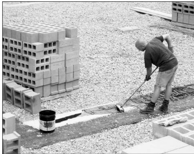
A contractor applies a polymer-enhanced asphalt membrane on top of the footer to act as a capillary break.

moisture accumulation. The controls for the ERVs are separate from the heating and cooling system, allowing the fan in the ERV to run continuously. Switches in the bathrooms put the ERV fan into high speed, allowing the ventilation rate to be doubled on demand. The exhaust air flow is designed to be the same from each bathroom, so when the ventilation rate is doubled in one bathroom, it is doubled in all of them. Although the ventilation strategy was uncommon, the materials used were typical, so there were no additional costs associated with installing the ventilation system.